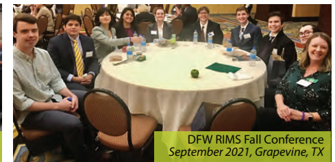
DFW RIMS Fall Conference September 2021, Grapevine, TX