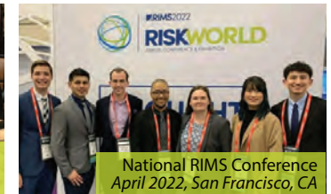
National RIMS Conference April 2022, San Francisco, CA