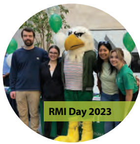
RMI Day 2023

Our very first RMI Day event was held with a festive setting in the Ryan College of Business atrium this past spring. The gathering had a great energy and was well-attended by both business students and industry supporters of the UNT RMI program. It was a wonderful chance for our students to get connected to our advisory board members. Going forward, we hope to make this an annual event.