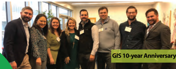
GIS 10-year Anniversary

The UNT RMI program's annual RMI Week once again exceeded expectations – the week was filled with unique events and opportunities for students and industry to interact and get to know one another. We kicked off the RMI Week with a timely and poignant sit-down luncheon sponsored by the Travelers Institute on the topic of Economic and Public Policy Outlook: Understanding the Impacts on Today's Business Community and Tomorrow's Top Talent as it relates to the insurance industry. Toyota Connect, Toyota corporation's North American technology partner, was also on campus with a lunch-n-learn titled Telematics - the Future is NOW! They addressed the auto insurance underwriting implications associated with the cutting-edge development of telematics technology.