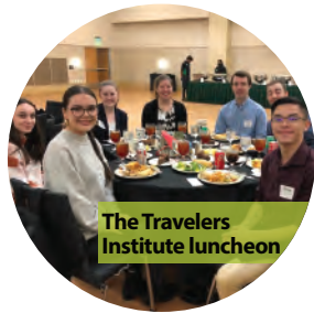
The Travelers Institute luncheon

The UNT RMI program's annual RMI Week once again exceeded expectations – the week was filled with unique events and opportunities for students and industry to interact and get to know one another. We kicked off the RMI Week with a timely and poignant sit-down luncheon sponsored by the Travelers Institute on the topic of Economic and Public Policy Outlook: Understanding the Impacts on Today's Business Community and Tomorrow's Top Talent as it relates to the insurance industry. Toyota Connect, Toyota corporation's North American technology partner, was also on campus with a lunch-n-learn titled Telematics - the Future is NOW! They addressed the auto insurance underwriting implications associated with the cutting-edge development of telematics technology.