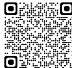
RMI Career Fair Video

To spread the word about RMI and GIS, the program has created two videos! The first focuses on the broader student population and illuminates the career opportunities in the insurance industry and the annual RMI career fair. The second video focuses on promoting student involvement in the GIS student organization. Please check them out.